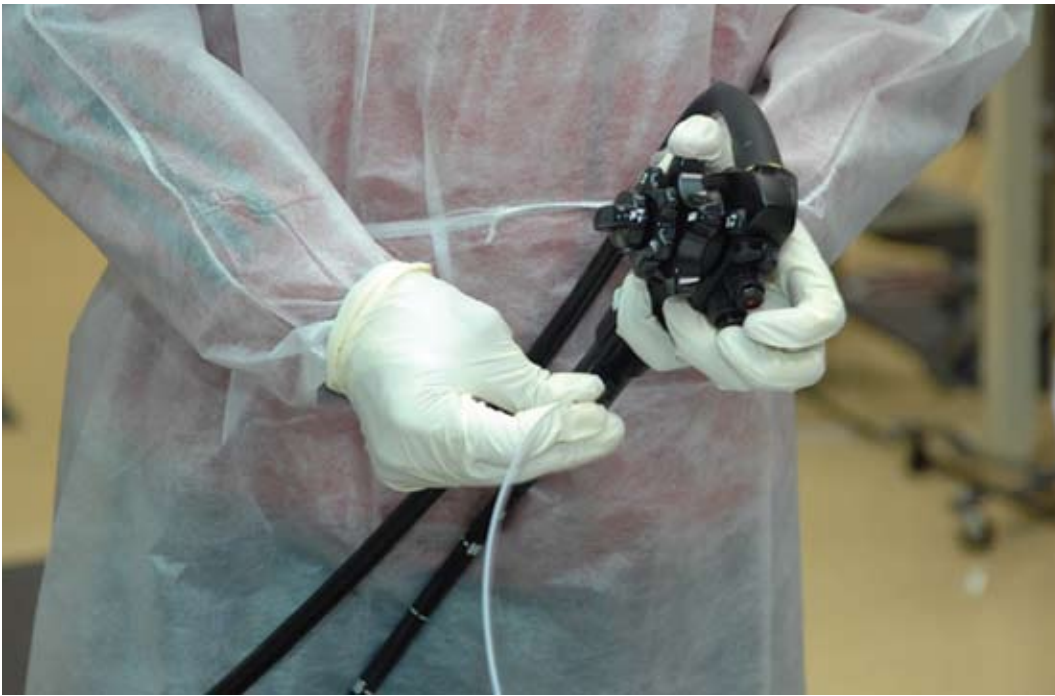
An endoscope is a medical device used by expert physicians to look inside the digestive tract.