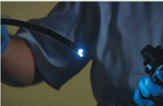
The endoscope is a thin, flexible tube with a camera and a light on the end of it. During the procedure, images of the colon wall are simultaneously viewed on a monitor.